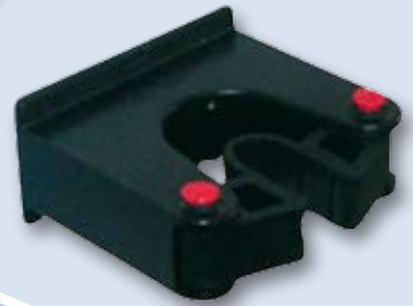
DT500BK DT510BK DT520BK