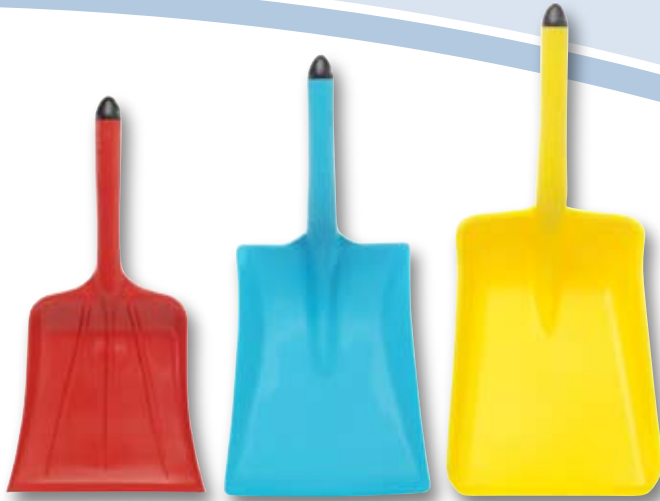
HCHD - 01