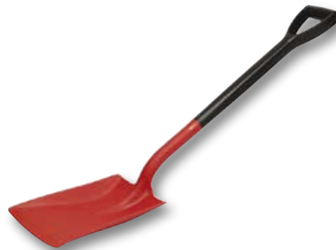
HCHD - 04 HCHD - 05 HCHD - 06