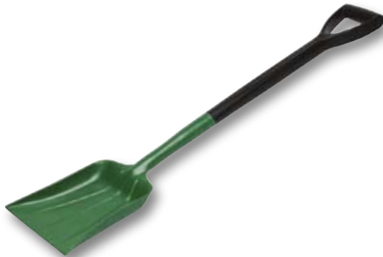
HCHD - 02