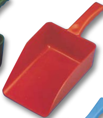
HCHD - 41