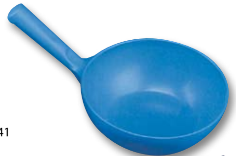
HCHD - 44