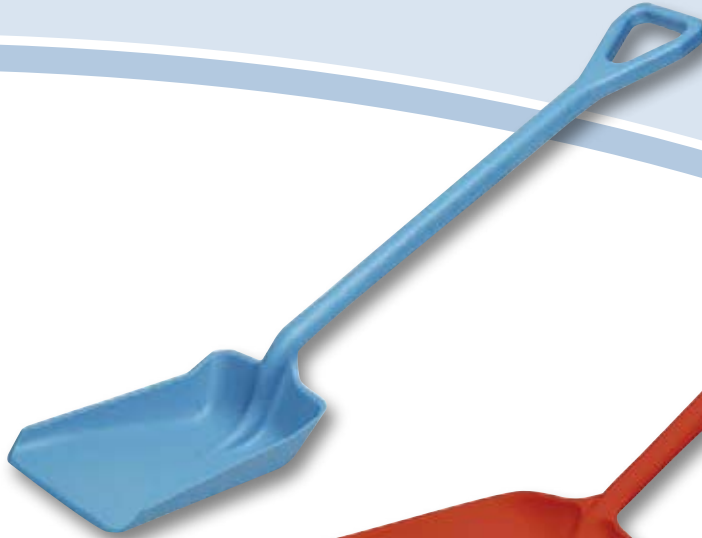
HCHD - 75