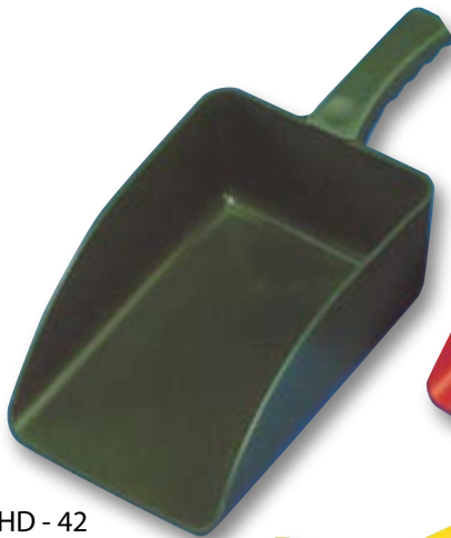
HCHD - 42