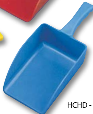
HCHD - 39